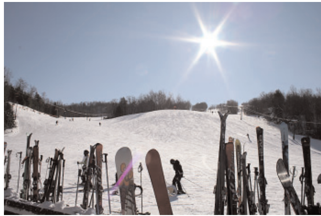
INDIANHEAD SKI RESORT