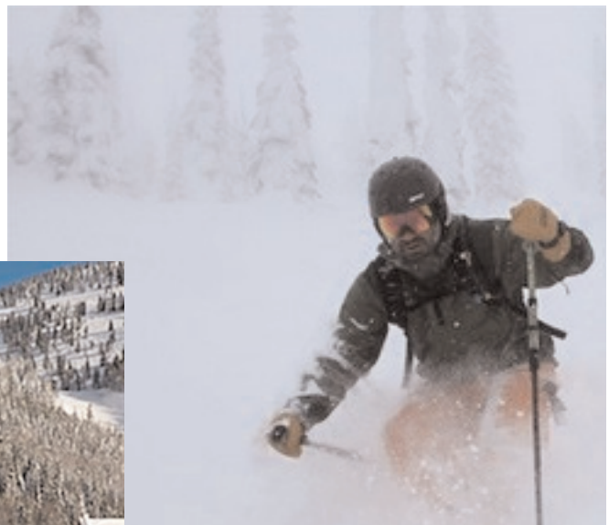
Snow Ghosts at Whitefish