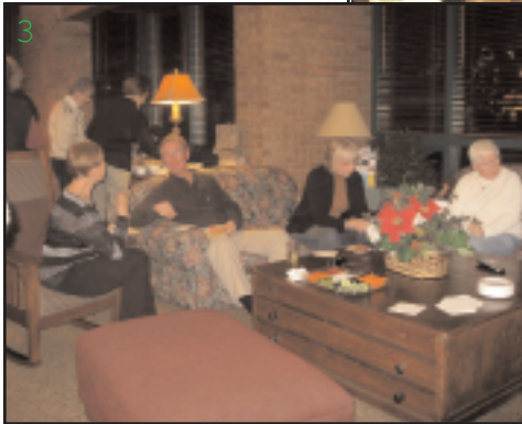
Our Minnesota contingency + 1