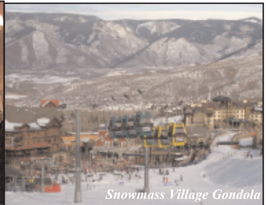
Snowmass Village Gondola